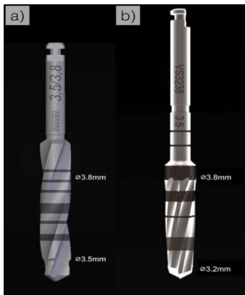
Fig 1 Geometric design of a) standard burs and b)Osseodensification multi fluted tapered burs

The rationale is that compacted, autologous bone immediately in contact with an endosteal device will not only have higher degrees of primary stability due to physical interlocking between the bone and the device, but also facilitate osseointegration due to osteoblasts nucleating on instrumented bone in close proximity to the implant.(13)