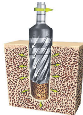
Fig 3: a) Densifying mode

Cutting and Densifying must be done under constant water irrigation. A pumping motion is required to prevent overheating. Surgical drills and burs should be replaced every 12-20 osteotomies or sooner when they are dulled, worn, or corroded.