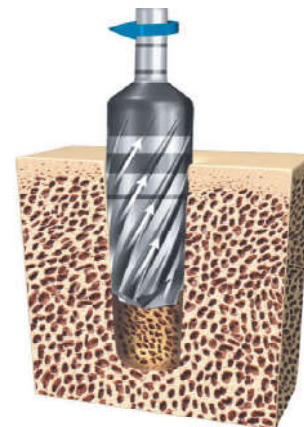
Fig 3 b) Cutting mode