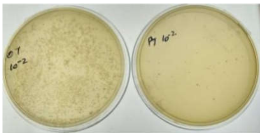
Figure 2 shows the microbial culture before & after the use of Chlorhexidine mouthwash